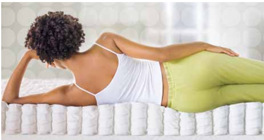
Pocketed Coil® springs are wrapped individually for perfect support.

Hybrid mattresses: These have combined layers of foam and coils, blending the best qualities of each. They're the perfect choice for parents who can't decide between coil and foam and would like to split the difference.